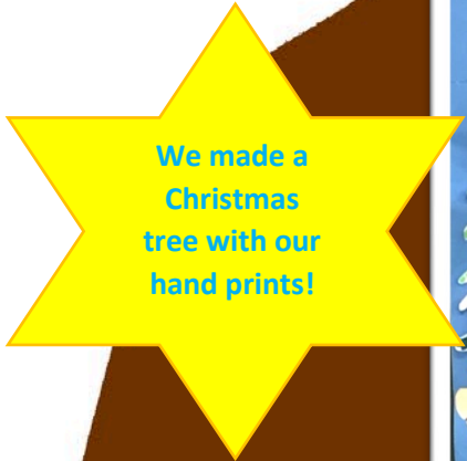
We made a Christmas tree with our hand prints!