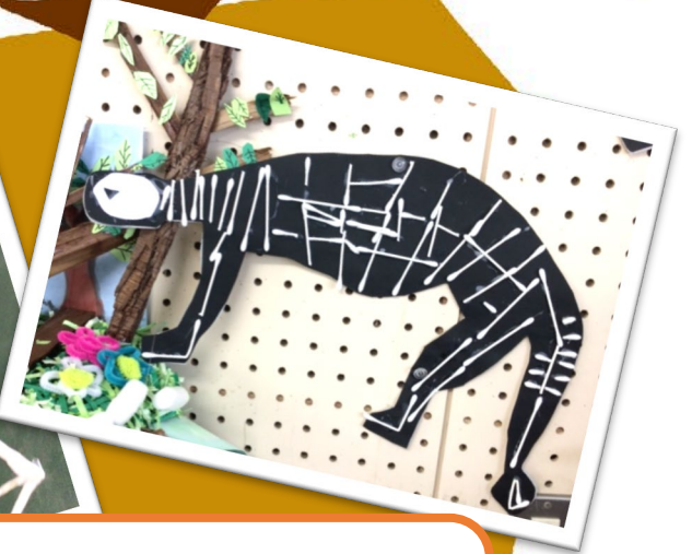
Swallow class learned all about Paleontologists! We dug 'dinosaur bones' out from the sandbox. Then we worked in our groups to put dinosaur skeletons together.